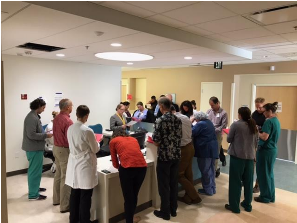
Many of our physicians and residents taking their Fire Life Safety competencies.