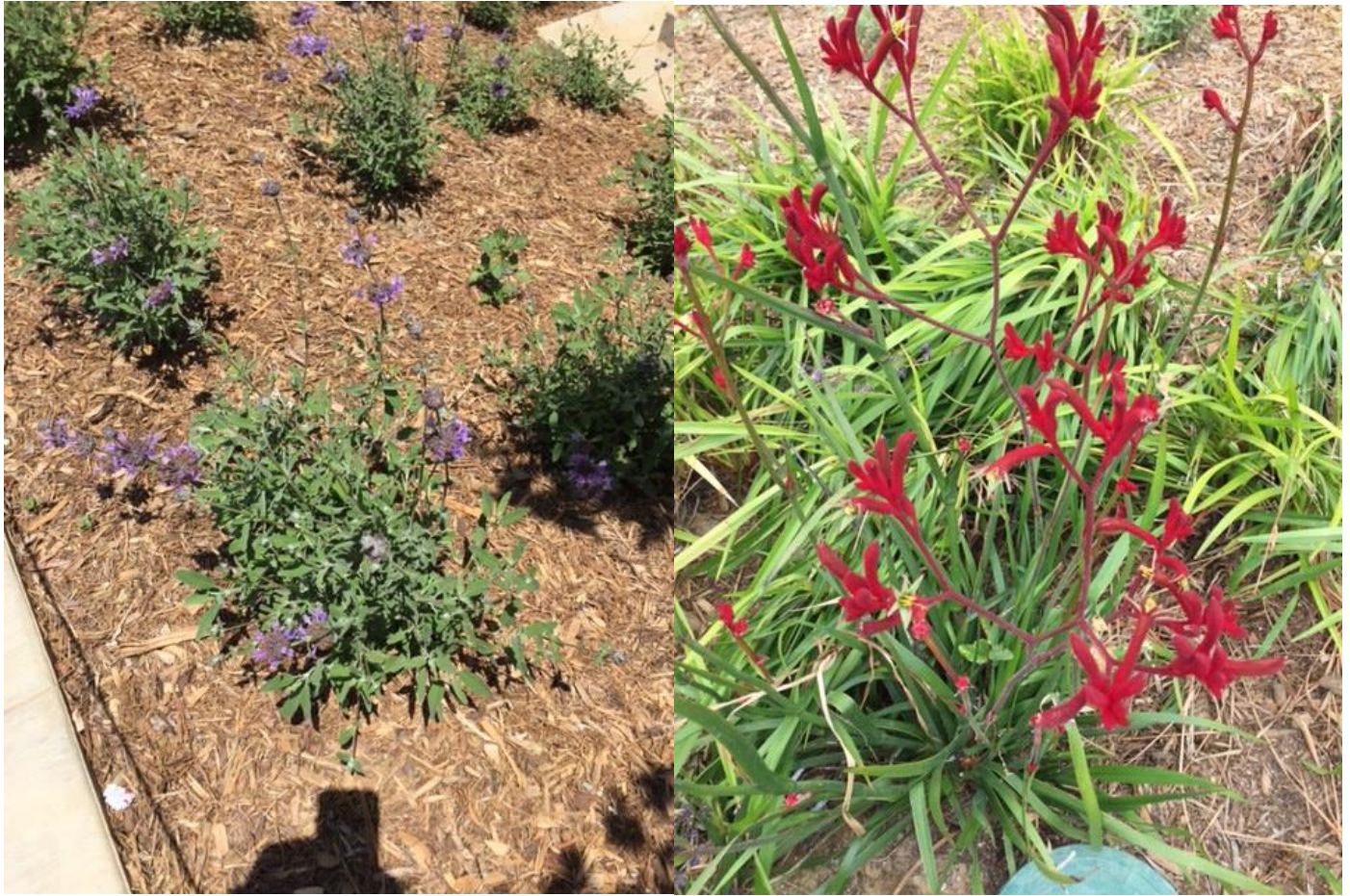
Our new landscape is filled with native plants and is just beginning to show some blooms.