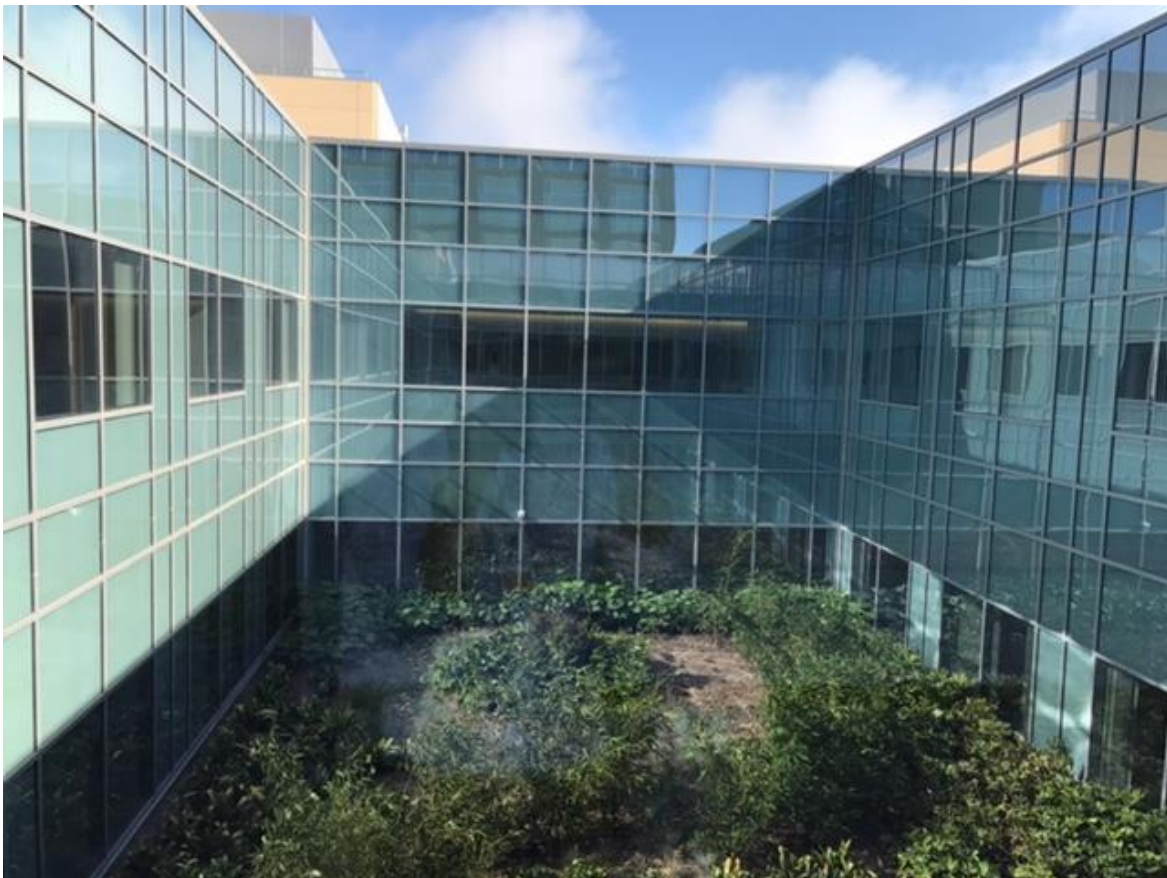
A look at the Viewing Garden filled with reflections and geometrics.