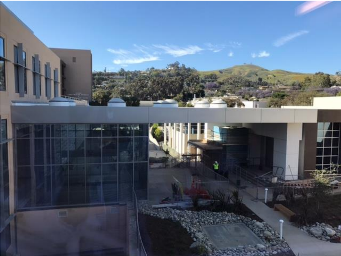
Looking from the Healing Garden in the foreground, through the upper Café Connector to the Plaza and beyond to Two Trees!